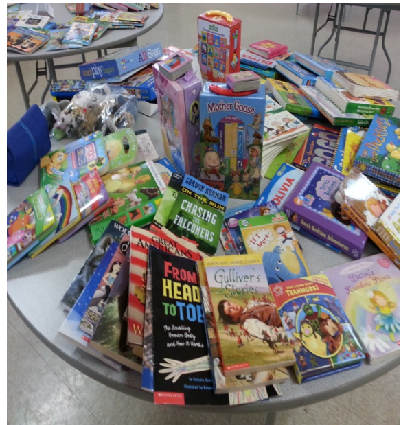
Alpha Chi's fundraiser at Wild Wings