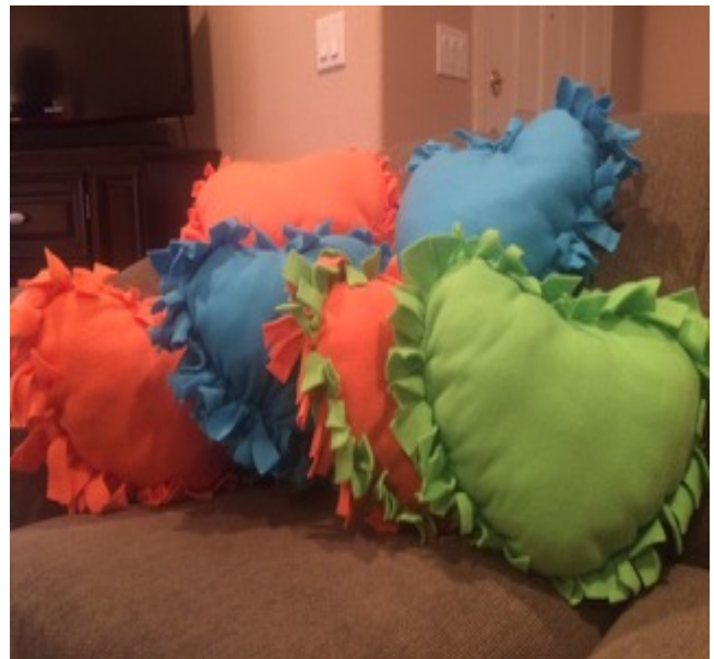
The Eta Pi chapter had a work party making heart pillows for the VA Hospital