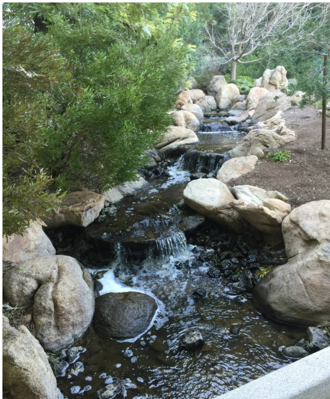
The Japanese Friendship Garden The Waterfall