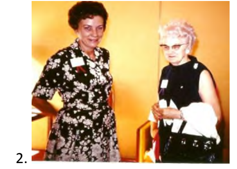
Can you name these ladies?