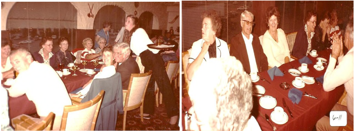
More of Arizona dinner

Arizona Dinner at an IC Convention How many can you remember and/or name?