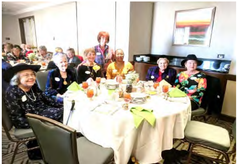
Alpha Kappa Chapter