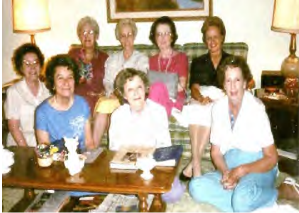
Alpha Alpha chapter Our 1 st chapter of the AZ Council