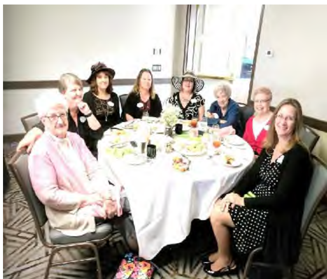
Alpha Chi chapter and Eta Pi and one Gamma Iota