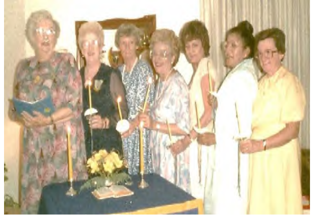
Alpha Lambda at their installation