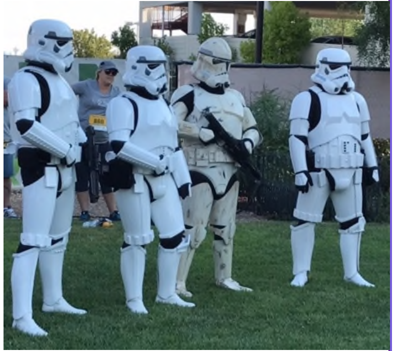
They sure know how do a walk in Las Vegas, even Storm Troopers were there!