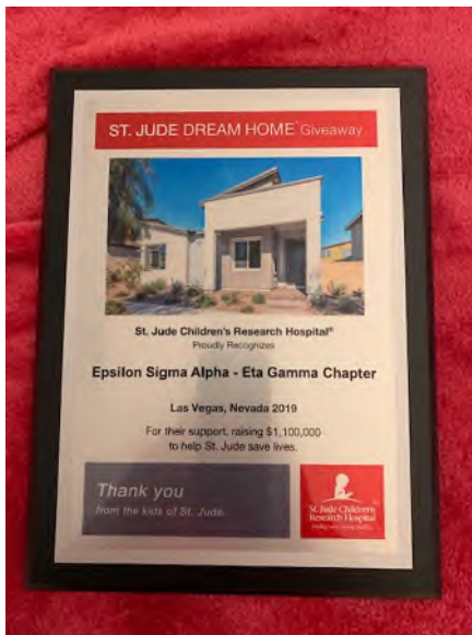
Eta Gamna received this at the Dream Home give away for their volunteers