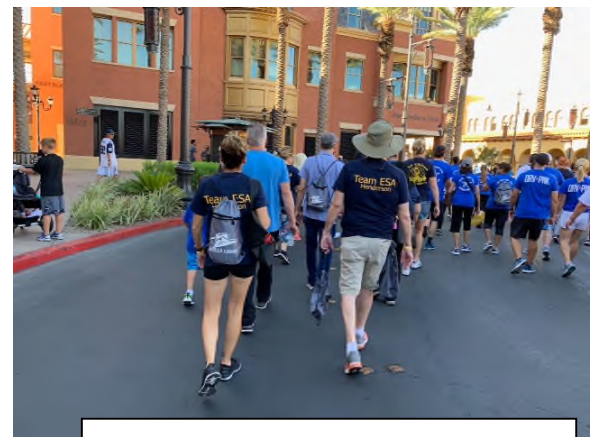
Nevada St. Jude Give Thanks Walk