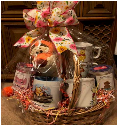
Raffle basket #1