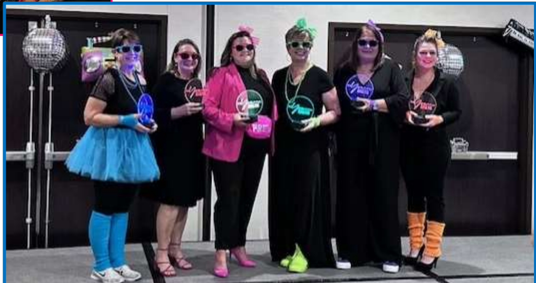
Incoming MARC officers