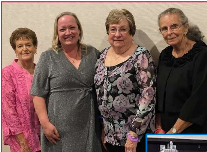
Gamma Pi members and me. My chapter in Indy.