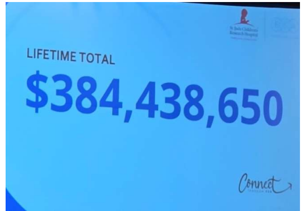
Raised since 1972 by ESA for St. Jude