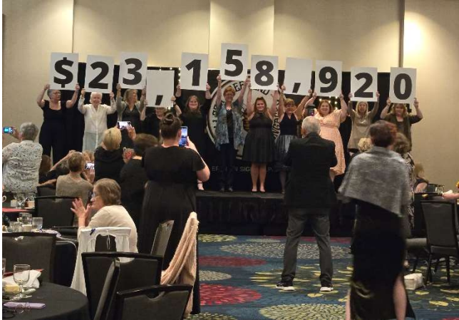
Total Raised by All ESA in 2023-24 for St. Jude