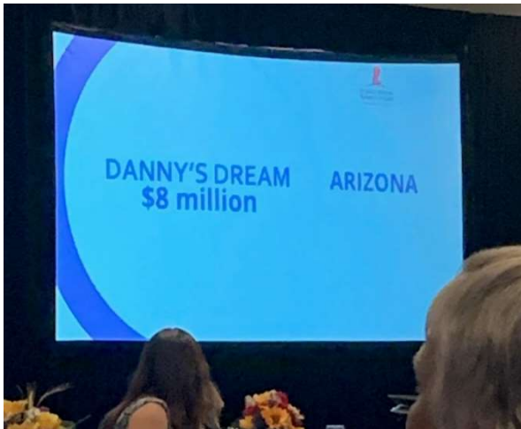
AZ/NV ESA Lifetime Contributions to St. Jude Numbers