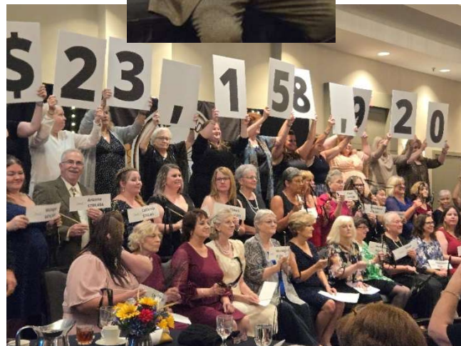
All States Celebrate the St. Jude

More pictures will be shared in the coming weeks.