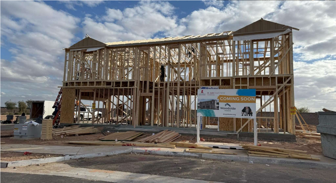
FRAMING OF DREAM HOME HAS STARTED.