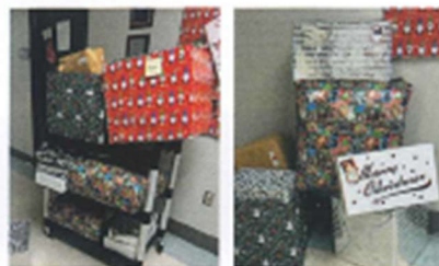
Pictured here is a small sample of all the gifts donated to veterans and their families by the chapter.

family. The membership not only met these requests but also went above and beyond, wrapping each gift with care and including heartfelt letters of holiday cheer.