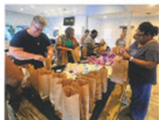
Omega Alpha partnered with other area ESA chapters to pack toiletry bags for Women4Women.

"Recognizing that many female veterans face barriers when transitioning back to civilian life, Omega Alpha began our first initiative: creating and distributing toiletry bags and feminine hygiene products. These bags were thoughtfully filled with essentials - shampoo, deodorant, toothpaste, and personal hygiene items - tailored to the specific needs of women. We partnered with the local Veterans Affairs (VA) hospital and Tempe-based nonprofit organization Women4Women to ensure the bags reached those who needed them most.