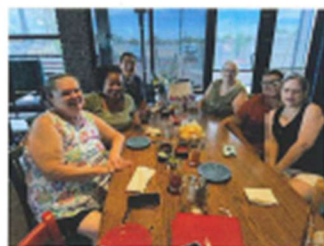
A group of Omega Alpha members enjoyed lunch together - planning their next project, no doubt!

"In just a short time, Omega Alpha became a beacon of hope and support for veterans in Phoenix. As this chapter grows, so will our impact. Together, we inspired other organizations to follow our lead, creating a ripple effect of compassion throughout the community. For the members of Omega Alpha, our journey was about more than service - it was about building a legacy of kindness, respect, and gratitude for those who had given so much."