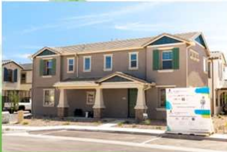
St. Jude Dream Home

You're Invited to the St. Jude Dream Home Giveaway on Wednesday, May 7 th !