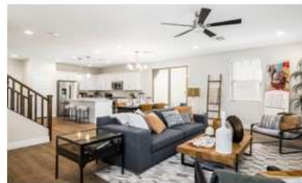
St. Jude Dream Home

This is the last weekend the St. Jude Dream Home will be open to the public. Stop by the house on Saturday, May 3 from 9 a.m. – 5 p.m. or on Sunday, May 4, from 12:00 p.m. – 5:00 p.m. to see the home. While there, enter for a chance to win the Open House Prize – a pair of stainless-steel watches courtesy of Molina Fine Jewelers.